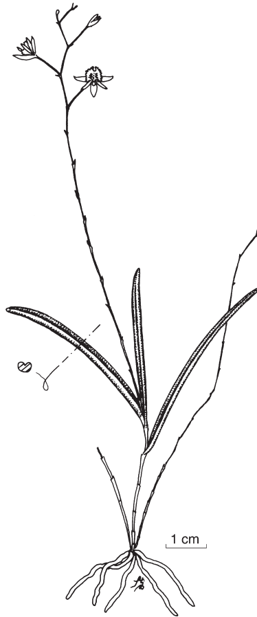
Fig. 1. Drawing of Microepidendrum subulatifolium plant by Stig Dalström.

characteristics. A recent three-gene DNA phylogenetic study (Fig. 2) confirms these findings (Higgins, van den Berg and Whitten, in press). The only other name ever proposed for this species is Microepidendrum subulatifolium (A. Rich & Gal.) Brieger. However, when Brieger published the genus Microepidendrum (Brieger, 1977) he failed to provide a Latin diagnosis and to designate a type species, thus the name is invalid (Greuter et al., 2000). The generic name must be validated before the combination can be used.