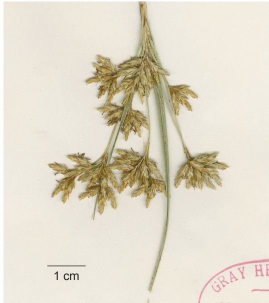
Fig. 1. Inflorescence of Cypringlea analecta (Beetle) M. T. Strong [ Purpus 5454 (GH, isotype)].

Cypringlea analecta (Beetle) M. T. Strong, Novon 13: 125. 2003. Scirpus analecta Beetle, Brittonia 5: 148. 1944 (as Scirpus analecti ). Type: Mexico. San Luis Potosi, Minas de San Rafael, May 1911, C. A. Purpus 5454 (holotype, NY; isotypes, F, GH, MO, UC (has date of July 1911 according to Strong, 2003), US).