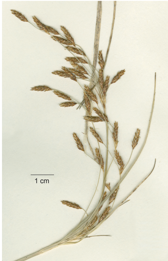
Fig. 2. Inflorescence of Cypringlea evadens (C. D. Adams) Reznicek & S. González [ Breedlove 11204 (MICH)].

as the inflorescence; primary rays 5-15 ascending to curving with age, at least the thinnest more or less flexuous, flattened or compressed-trigonous, antrorsely scabrous on margins distally, smooth proximally, the longest 5-11 cm, second, third, and occasionally fourth order branching present, with the spikelets ultimately sessile or rarely short-peduncled (< 5 mm) in fascicles of 2-7 or rarely solitary at tips of primary or second order branches. Spikelets 25-200 per inflorescence, not more than 15% peduncled, linear-ellipsoid, 4-9.5 mm long, 1.7-2.7 mm wide, cuneate at base, acute at apex; scales somewhat spreading, loosely spirally arranged, with 2-4 sterile scales at the base of the spikelet (excluding the prophyll) and 8-25 fertile